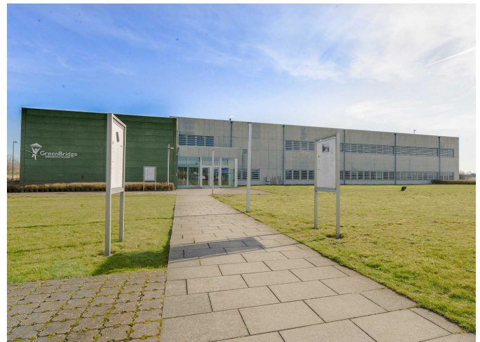
Innovation Hub of Greenbridge

http://www.pomwvl.be/fabriek-voor-de-toekomst-blue-energy https://issuu.com/pomwest-vlaanderen/docs/pom_fvt_blue_energy?e=28759921/55654016 http://www.fabriekenvoortoeekomst.be/fabriek-voor-de-toekomst-blue-energy