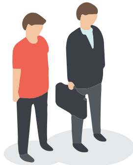
Mother Company Stora Enso Group

“Stora Enso Langerbrugge is one of the most productive newspaper machines in the world”