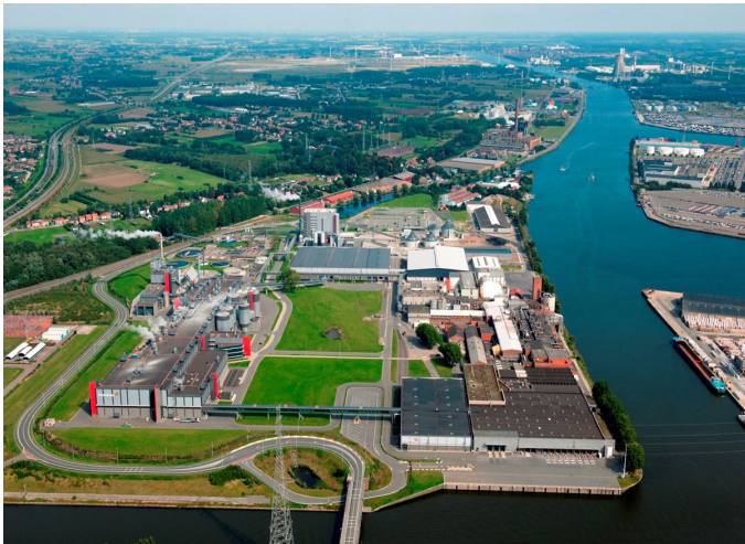
Stora Enso site at the port of Ghent