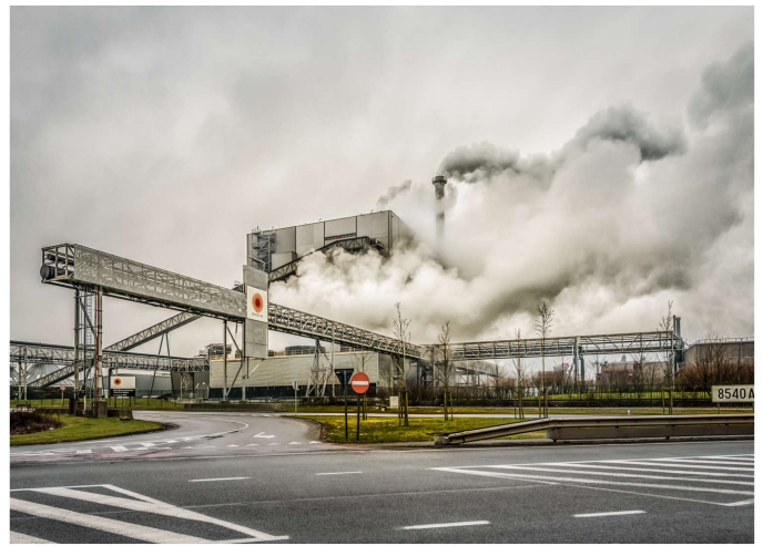
Stora Enso site at the port of Ghent