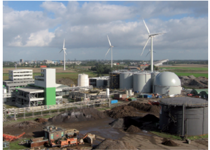
Heros Ecopark Terneuzen