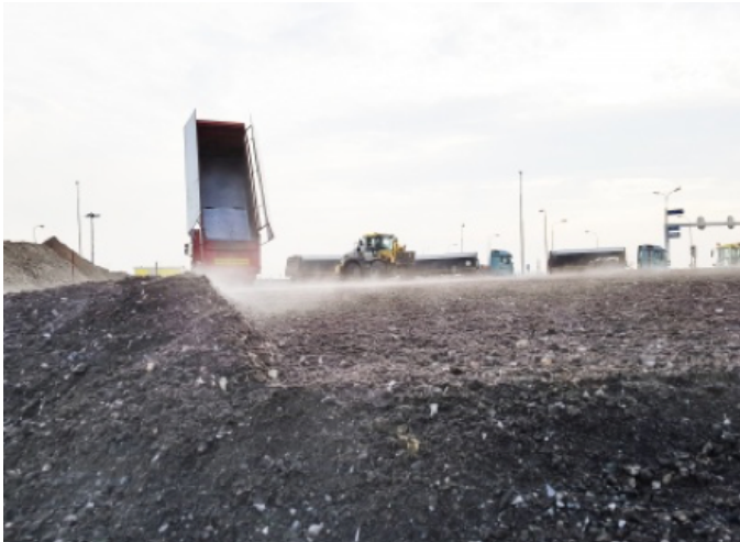
Recycling of granulate at Heros Sluiskil