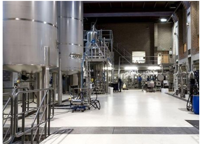
Bio Processing research plant

The relationship with the port is not that linear and evident, but the practice carried out from Bio Base Europe Pilot Plant has a strong potential to be in relation with many activities taking place within the port, since the biobased economy places an important role in the Ghent harbour.