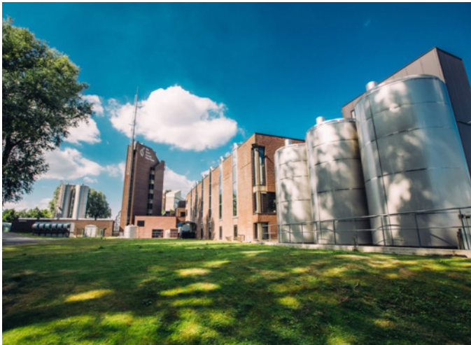
Bio Base Europe Pilot Plant