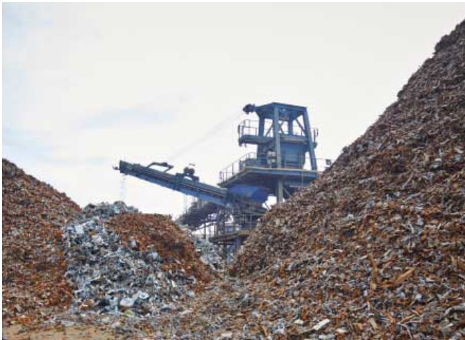
Scrap materials collections plant