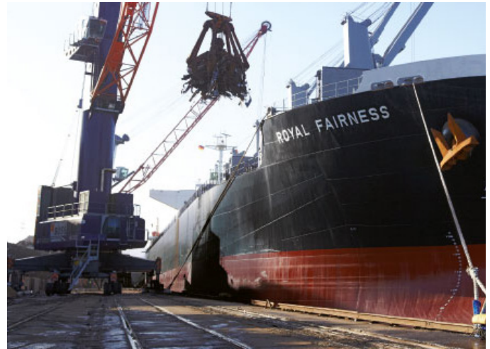
Transportation of scrap materials via water

Transportation of scrap materials is happening also by water, in this sense, being located in the harbor is relevant under a strategic but also logistic point of view.