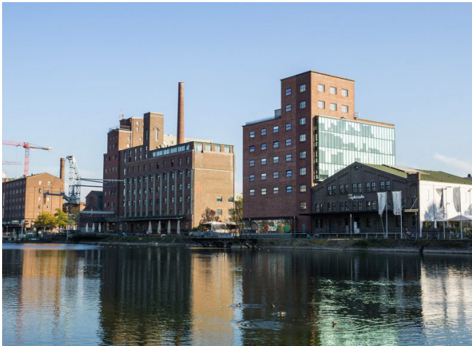
Start Port Head office