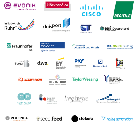
Partners involved in Start Port