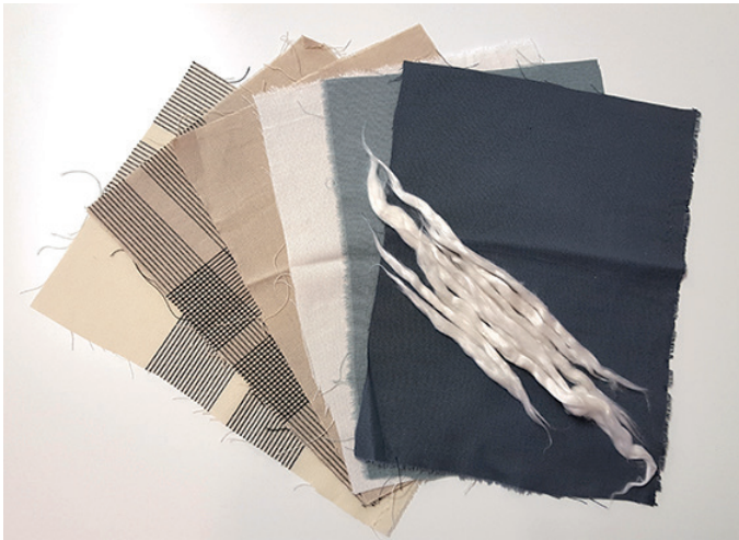
New fibers developed: Saxcell - for 100% gained from cotton waste.