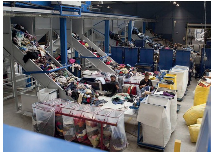
Besides Boer Group, there are many sorting centra in the region of Drechtsteden and Rotterdam!